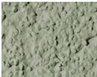
Stolit K 2.0 mm

Coloured self gauging float finishing renders.