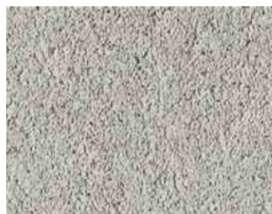
Stolit MP Natural

Coloured fine float, sponge or light adobe finishing render.