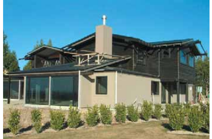
StoLite on a 4.5 mm fibre cement sheet.

By selecting the appropriate fibre cement sheet, the strength, bracing and acoustic properties of the exterior can be adjusted to meet the site conditions.