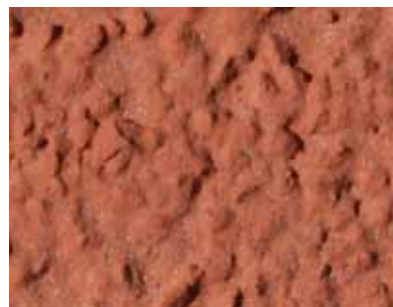
Stolit K 3.0 mm

Coloured self gauging float finishing renders.