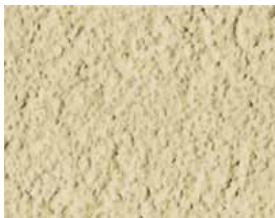
Stolit K 1.0 mm

The perfect combination of properties: Durable, strong, hardwearing, impact resistant, malleable, weather resistant, colour stable and highly resistant to micro-organism. They are designed with good vapour permeability to allow the building to breathe while still repelling liquid water. All renders are easy to apply and can be tinted from the StoColor System or matched to the colour of your choice, using the Sto spectrometer.