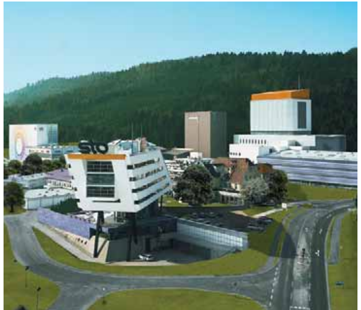
Head office Sto, Black Forrest, Germany.

As the authorized partner of Sto for Australasia, Stoanz Ltd is committed to the Sto philosophy. Today having developed a full range of Sto plaster systems that have been tested and certified by BRANZ for the New Zealand market, Sto is recognized as a leader in the plaster facade and cladding market.