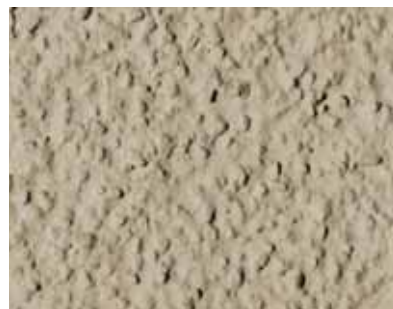
Stolit K 1.5 mm

Coloured self gauging float finishing renders.