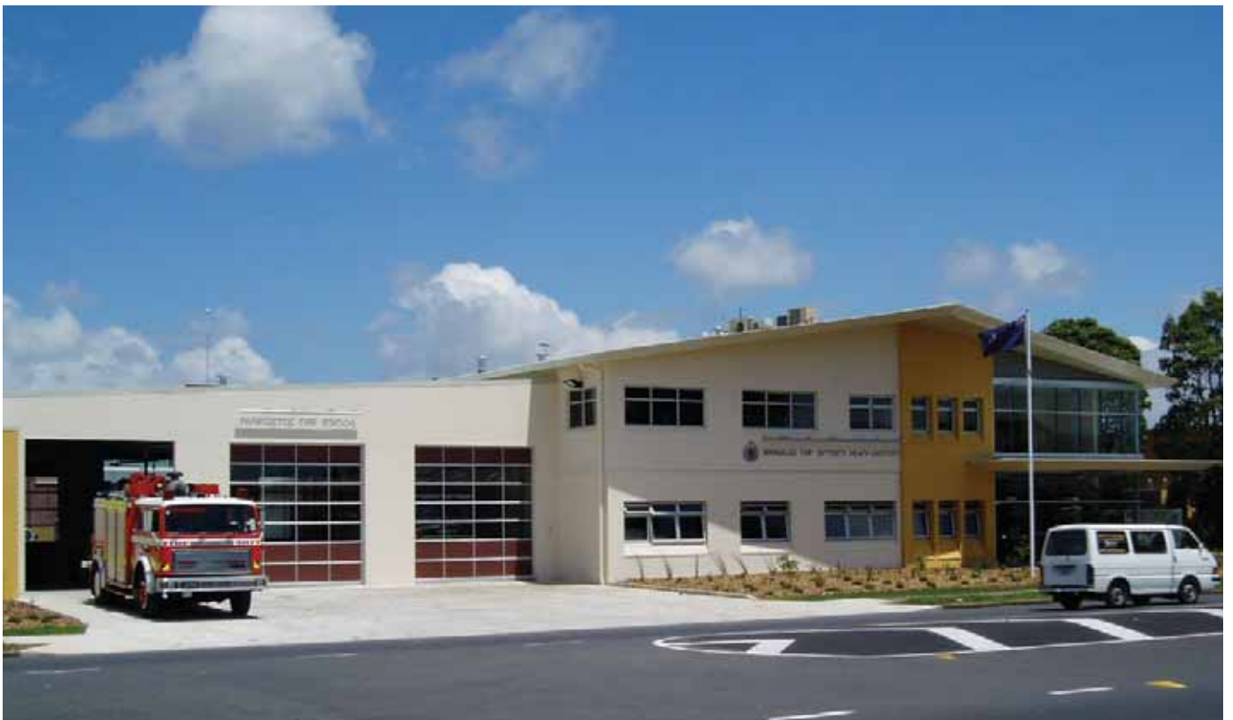
StoLite on a 7.5 mm fibre cement sheet.