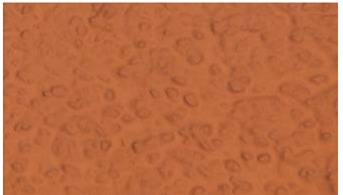
Stolit K 3.0mm