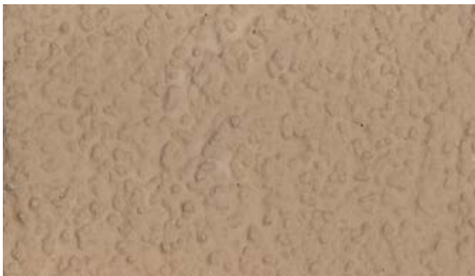
Stolit K 2.0mm