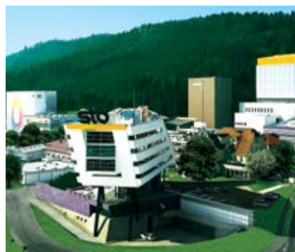
Sto Head Office, Research & Development, Production Centre Wiezen, Germany