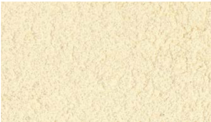
Stolit K 1.0mm

All Stolit renders are easy to apply and can be tinted using the StoColor System or matched to the colour of your choice using the Sto Spectrometer.