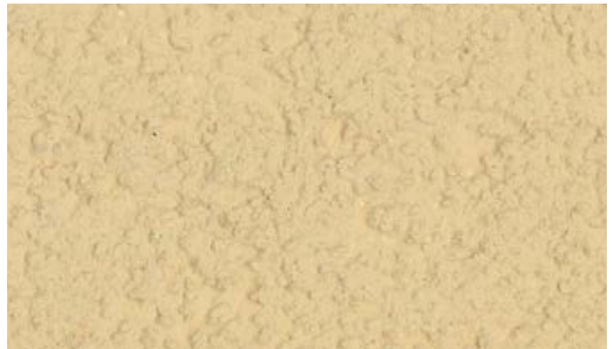
Stolit K 1.5mm