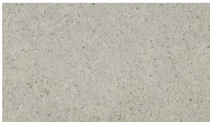
Stolit MP Natural