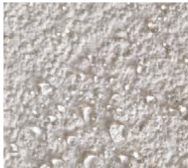
StoArmat Render System