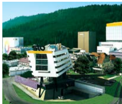
Sto Head Office, Research & Development, Production Centre Wiezen, Germany