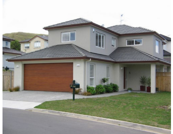
StoArmat Render System on Fibre Cement Sheet

email. info@sto.co.nz web. www.sto.co.nz