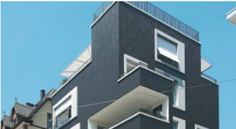
StoVentec C with ceramics Townhouse, Zürich, Switzerland Architectural firm: huggen_berger gmbh, Zürich, Switzerland