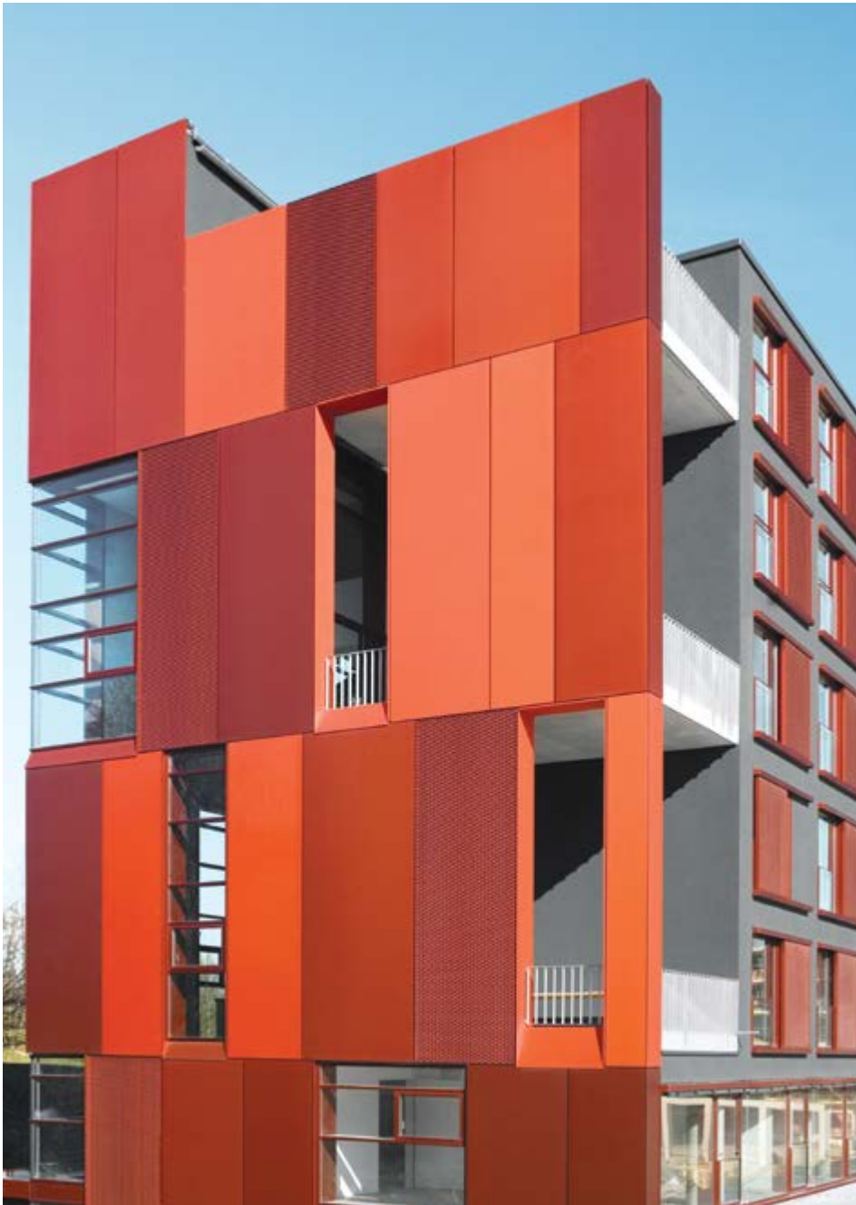
Student Housing, München, Germany Architectural firm: Spengler + Wischolak, Hamburg, Germany

At a glance: One system – a host of advantages.