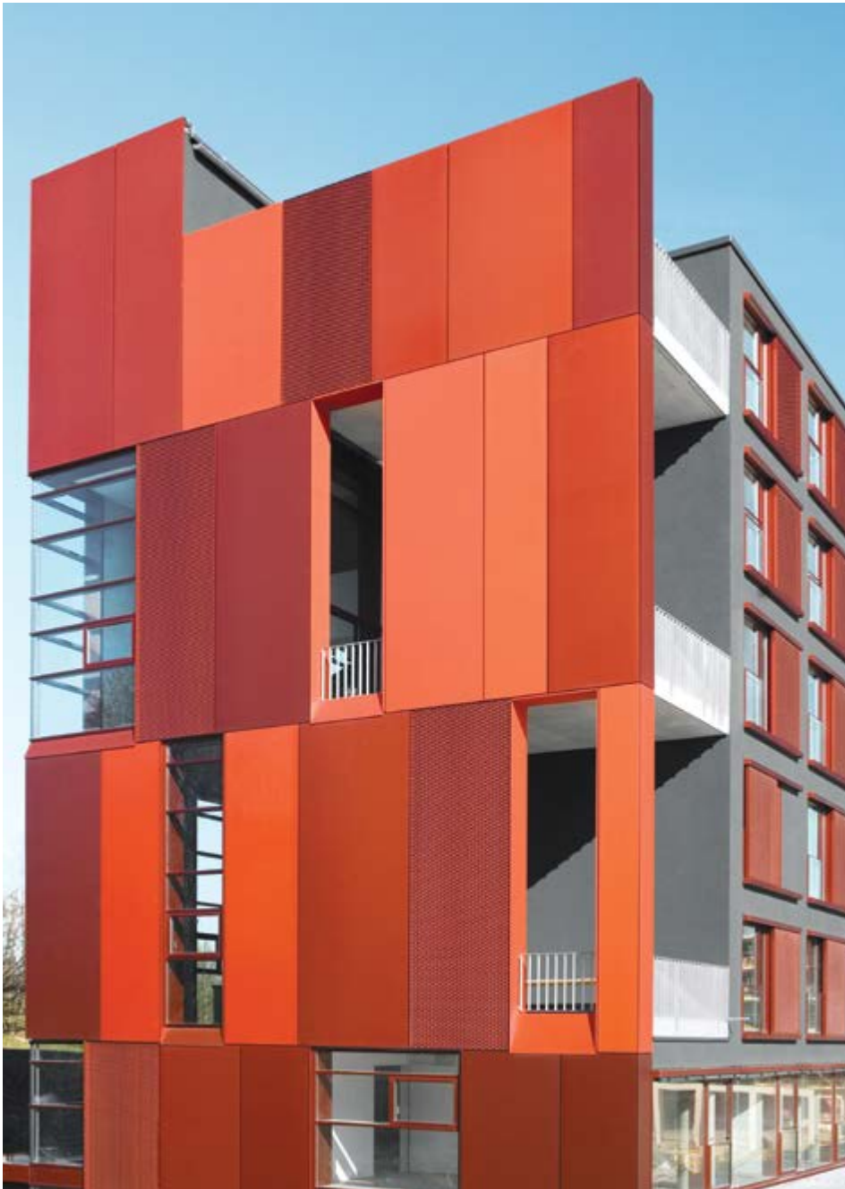
Student Housing, München, Germany Architectural firm: Spengler + Wischolek, Hamburg, Germany

At a glance: One system – a host of advantages.