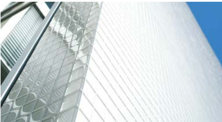
StoVentec M with glass mosaics Gewoge Haus, Brunnckstr, Ludwigshafen Architectural firm: Allmann Sattler Wappner, München, Germany