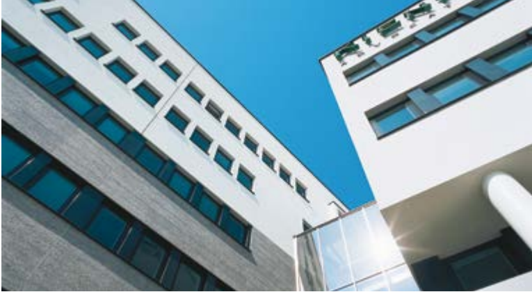
StoVentec S with natural stone Office building Drienerbeek, Enschede, Netherlands Architectural firm: I/AA Architects & Engineers, Enschede, Netherlands