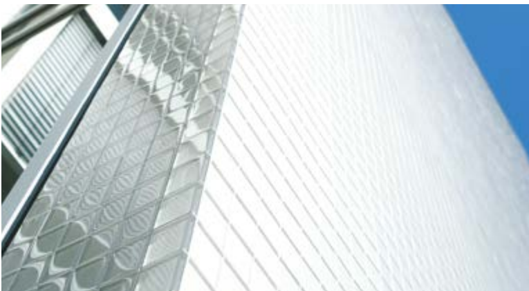
StoVentec M with glass mosaics Gewoge Haus, Brunnckstr, Ludwigshafen Architectural firm: Allmann Sattler Wappner, München, Germany