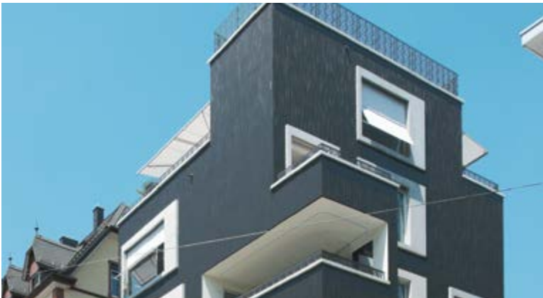
StoVentec C with ceramics Townhouse, Zürich, Switzerland Architectural firm: huggen_berger gmbh, Zürich, Switzerland