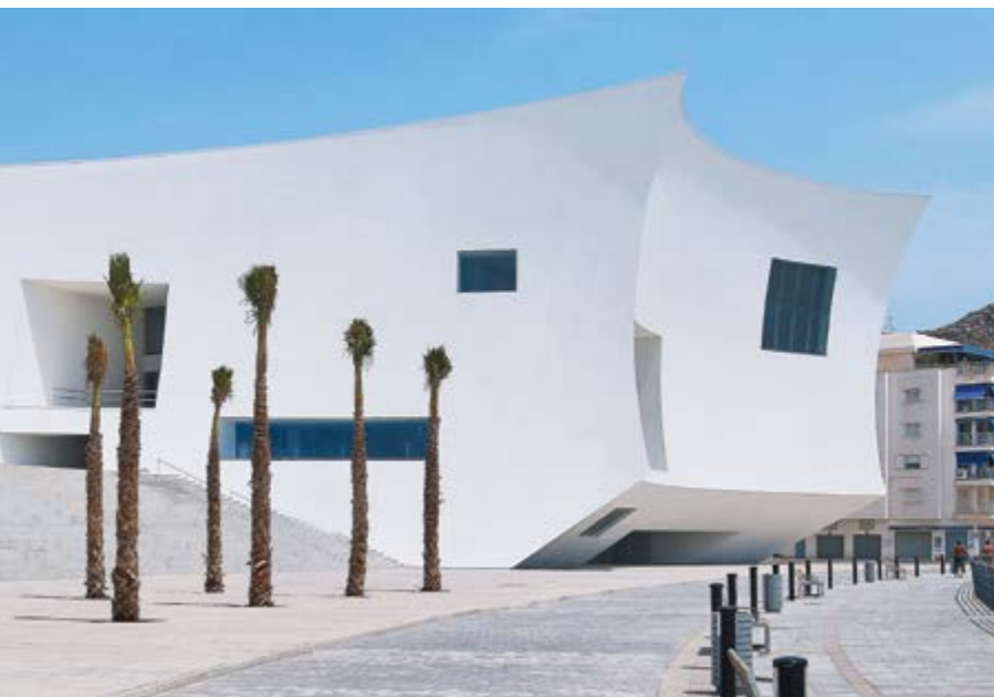
Auditorium and congresses, "Infanta Doña Elena", Aguilas /Spain Architectural firm: Barozzi Veiga, Barcelona

However severe the damage to the substrate, a solution is at hand: The adaptable sub-construction permits variable spacing between wall and render carrier board. This levels out unevenness and provides for rendition of the surface as detailed and drawn, however extreme the irregularities involved. Sub-construction problems are virtually unheard of, even on moist, cracked walls or unstable old plaster.