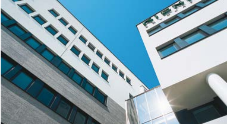
StoVentec S with natural stone Office building Drienerbeek, Enschede, Netherlands Architectural firm: I/AA Architects & Engineers, Enschede, Netherlands