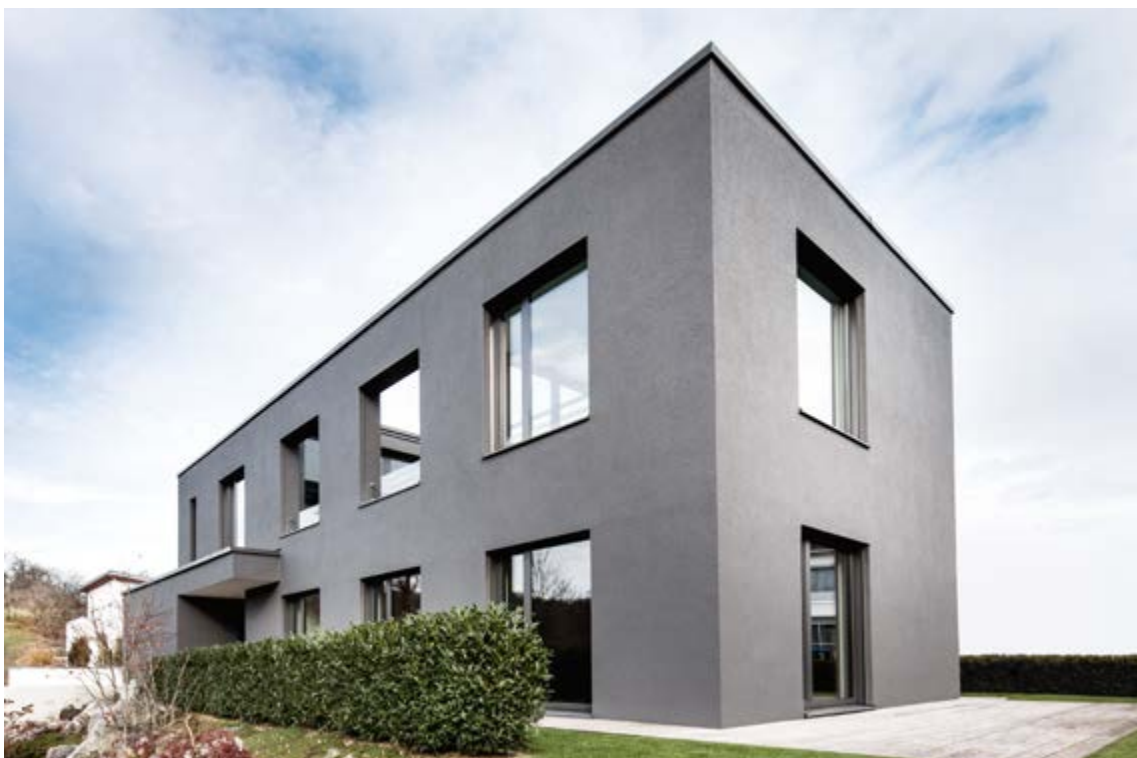
Residential house, Dettingen/Teck, DE StoTherm Classic, Stolit K 1.5, StoColor Dryonic®

For project specification please contact us.