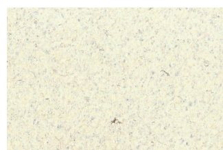
FS Natural 25kg bag only