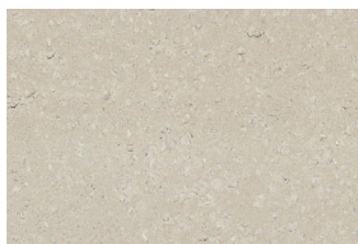
Pumice 125ml / 25kg