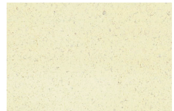
Panna cotta 125ml / 25kg