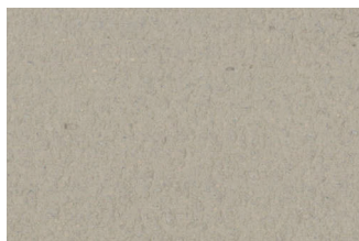
Riverbank 100ml / 25kg