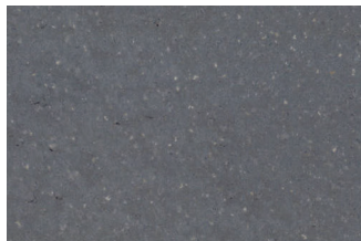
Wicked 250ml / 25kg