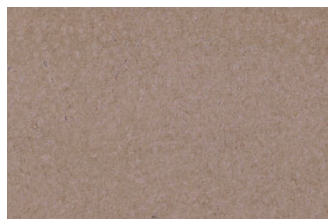
Savannah 125ml / 25kg