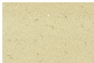
Willow 125ml / 25kg