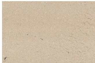
Tussock 125ml / 25kg