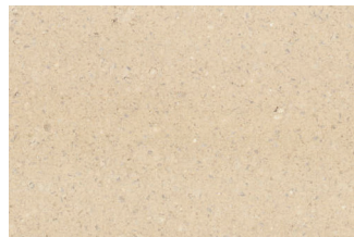
Almond 125ml / 25kg