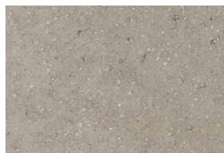
Bark 125ml / 25kg