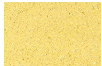
Bondi 125ml / 25kg