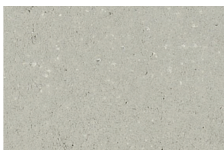
Calce Cement 150ml / 25kg