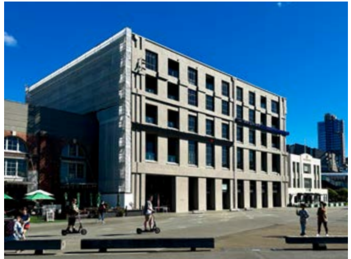
StoArmat Refurbishment Render System on existing masonry. NZX Centre, Wellington.